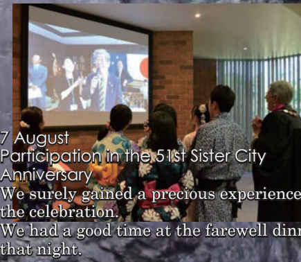
7 August Participation in the 51st Sister City Anniversary. We surely gained a precious experience in the celebration. We had a good time at the farewell dinner that night.