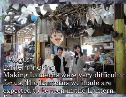
1 August Lantern making Making Lanterns were very difficult for us. The Lanterns we made are expected to be seen in the Lantern Parade next year.