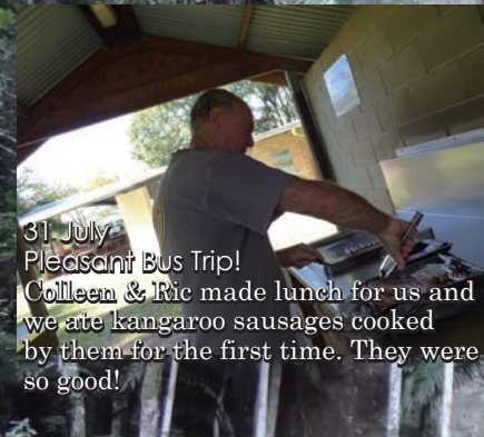
31 July Pleasant Bus Trip! Colleen & Ric made lunch for us and we ate kangaroo sausages cooked by them for the first time. They were so good!