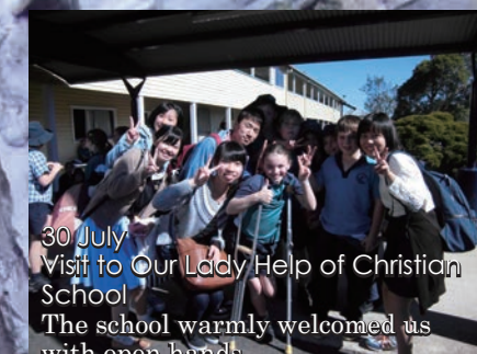
30 July Visit to Our Lady Help of Christian School The school warmly welcomed us with open hands. We were deeply touched then.