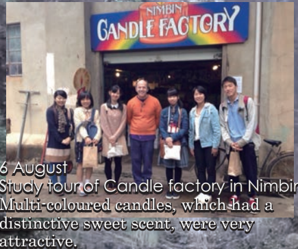
6 August Study tour of Candle factory in Nimbin. Multi-coloured candles, which had a distinctive sweet scent, were very attractive.