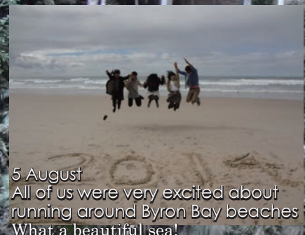
5 August All of us were very excited about running around Byron Bay beaches. What a beautiful sea!