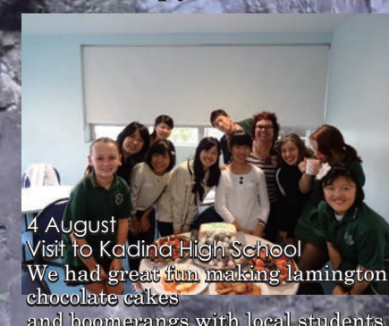
4 August Visit to Kadina High School We had great fun making lamington chocolate cakes and boomerangs with local students.