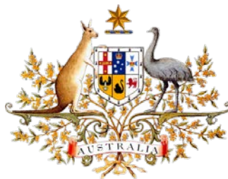
[State Symbol of Australia]