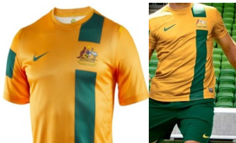
[National team uniform of soccer]

Spring is ushered in by the coming out of Jacaranda. This flower is called "Purple-colored cherry blossoms" by Japanese living in Australia.