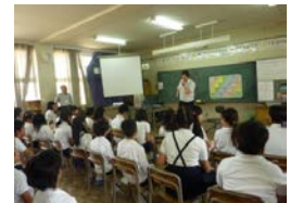
[English lessons by an Australian teacher]

The school district, behind which Mt. Katsuragi rises, covers a residential area located in the northwest part of the Nara Basin, that is, it is situated in the southern part of Yamato Takada City. The school celebrated the 30 th anniversary of its foundation last year, and it is the latest school founded in Takada. 366 pupils (180 boys, 186 girls), all of whom are very obedient and friendly as well, learn there eagerly and cheerfully. They exchange morning greetings warmly and there are many who take an active part in the school cleaning every day, so the corridors are all clean because pupils wipe the floors with their damp cloths very hard.