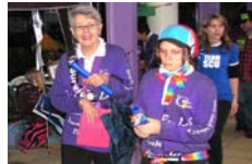
[Mayor (left) in the event]