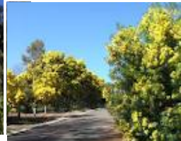
[Australia's National Flower: Golden Wattle]

The Golden Wattles, the national flower of Australia, are very similar to the Sakura blossoms in Japan. When the flowers begin to bloom, Australians realize that spring is come. The pattern of the flower is used as the national crest. In the sport world the yellow color of the Wattle petals and the green color of the leaves are also used as the traditional colors for the uniforms of the national teams of Australia.