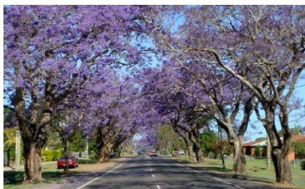
[Avenue of Jacaranda in full bloom]