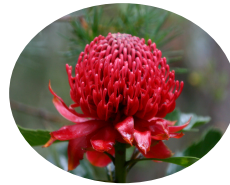
[State Flower of New South Wales: Waratah]